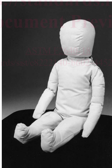
FIG. 2 CAMI Infant Dummy Mark II

6.4.2 The child restraint system shall include both waist and crotch restraint designed such that the use of the crotch restraint is mandatory when the restraint system is in use.