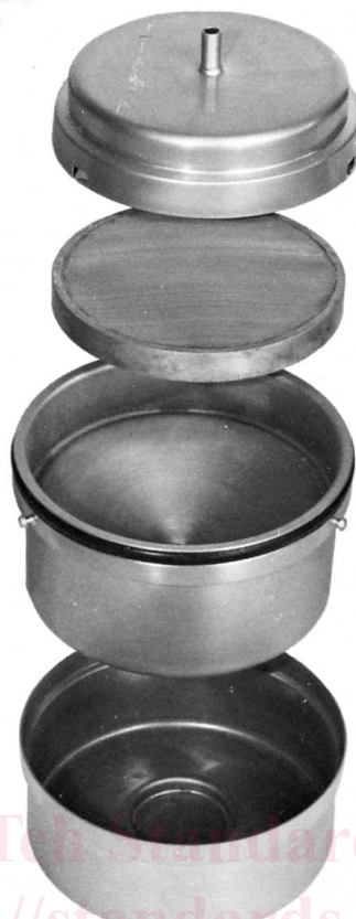
FIG. 1 Pressure Bleeding Test Cell A

3.1.3 oil separation, n —the appearance of a liquid fraction from an otherwise homogeneous lubricating composition.