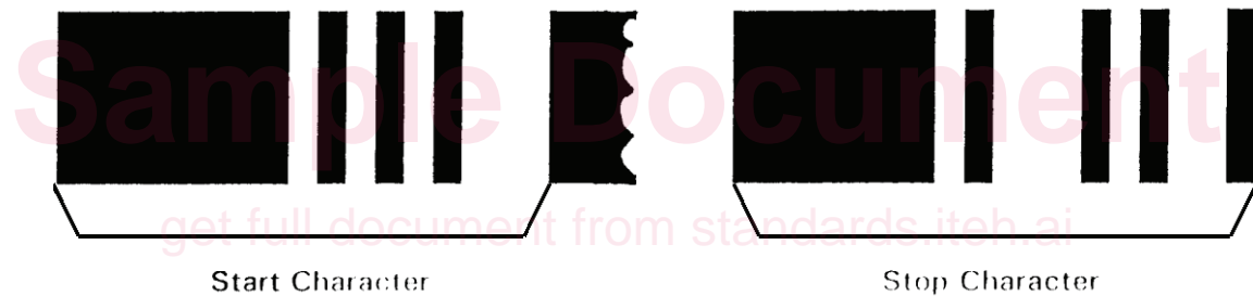
Figure 4 — PDF417 Start and Stop Characters

The start and stop characters shall have the same bar-space sequence for all rows.